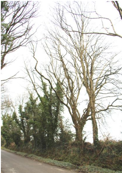
Figure 6. Specimens of matured Ash to east of Front Road (located west of site – Hedge no. 1)