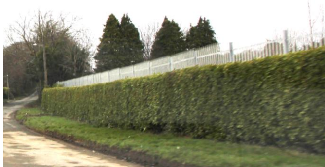
Figure 13. South-west Griselinia hedge with palisade fence (Hedge no. 5)