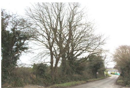
Figure 4. Hedge embankment, east facing Front Road (located West of the site – Hedge no. 1a)