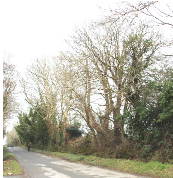
Figure 7. Specimens of matured Ash and Oak to east of Front Road (located west of site – Hedge no. 1)