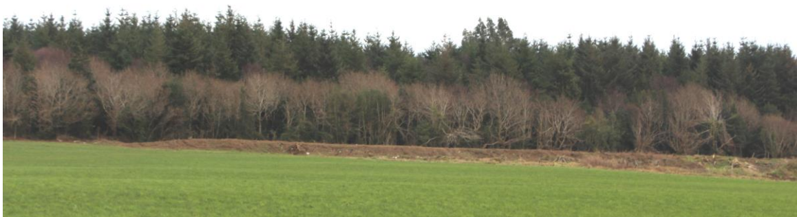
Figure 10. North-east Oak hedge (deciduous trees in the foreground - Hedge no. 3). Ramsfort Park in the background (evergreen trees).