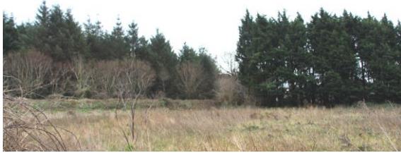
Figure 11. South-east Conifers hedge (evergreen trees – Hedge no.3/4)