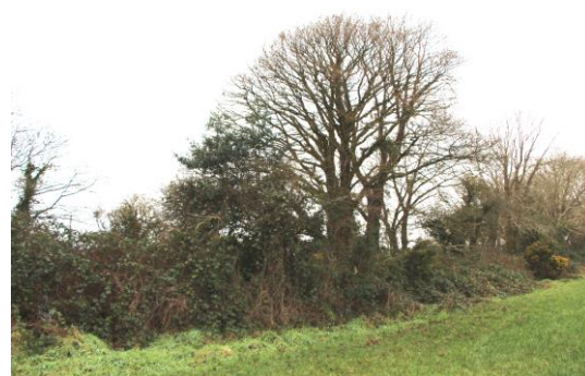
Figure 5. Overgrown hedge, adjacent to Front Road, facing opened field (West of the site – Hedge no. 1a)