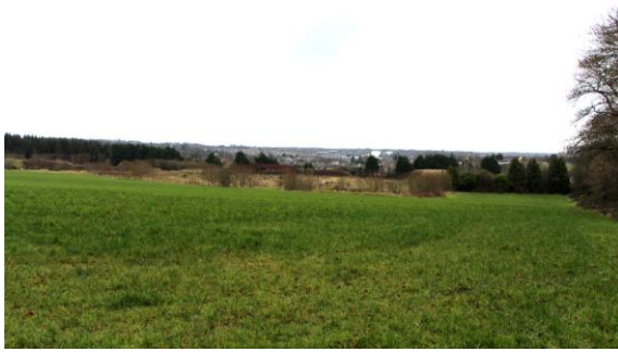
Figure 1. Large open field located North of the site.