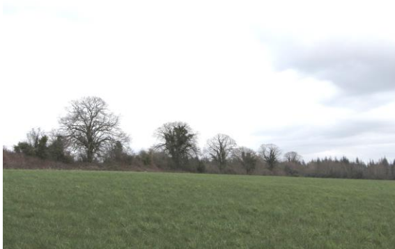
Figure 8. Hedge embankment, east facing Front Road (located west of the site – Hedge no. 2)