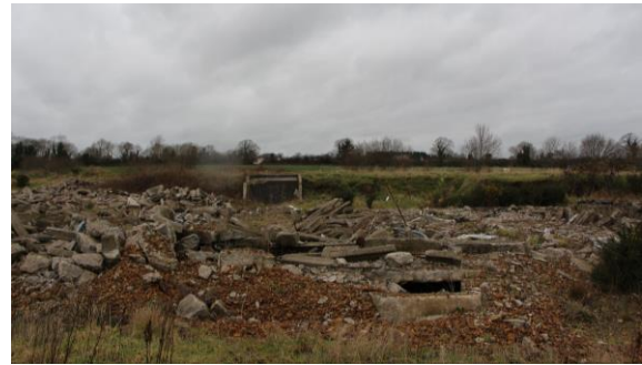
Figure 2. Demolished structures and buildings South of the site.

The site is bounded by the following Trees and associated hedgerows (Fig.3):