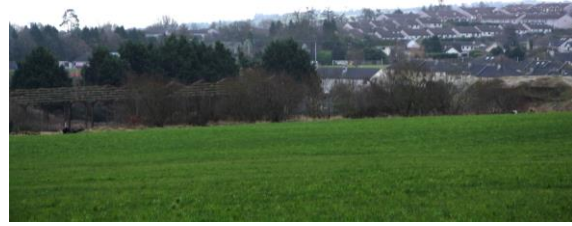
Figure 12. South-east Conifers hedge (Hedge no. 4). Gorey Corporation Housing in the background.