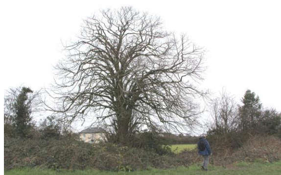
Figure 9. Specimen Lime to north